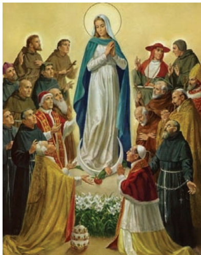
Queen of All Saints, Pray for us!

Sunday Contributions..... $ 697.60 Evangelization of Nations ..... $ 5.00